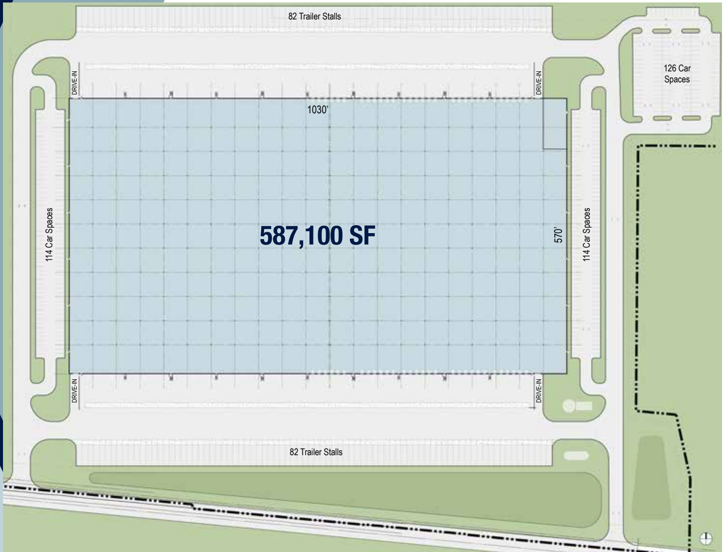
BETHEL INDUSTRIAL CENTER @ I-78 | Bethel, PA